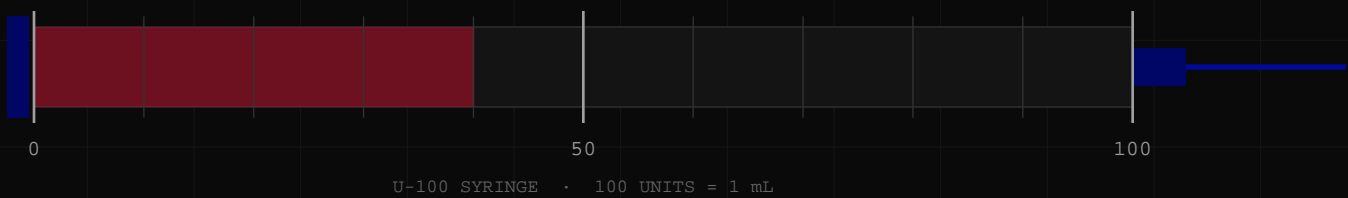
// TABLE UNITS TO mL

U-100 insulin syringes are calibrated so 100 units = 1 mL. This makes drawing tiny peptide doses dramatically more precise than a 1 mL syringe with broader graduations.